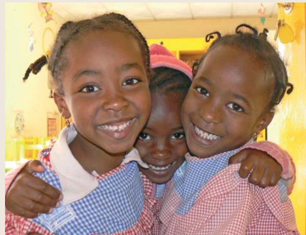
SOS Nursery School Assomada, Cape Verde

You can continue to help SOS Children by leaving a gift in your will. This is a wonderful, practical way to carry on supporting the children and villages you care about. For more information, please give us a call: 01223 365589 .