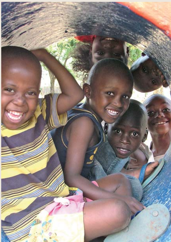
SOS Children's Village Nairobi, Kenya