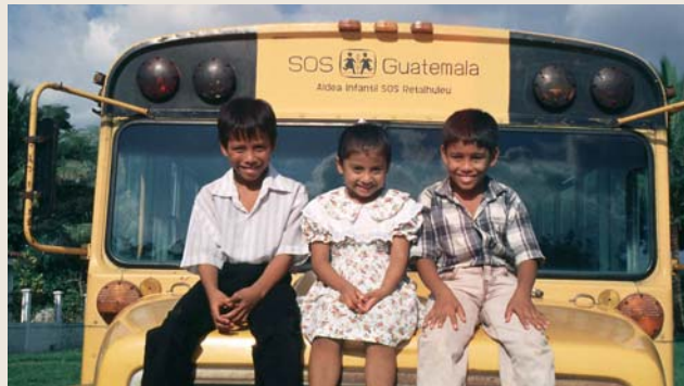
SOS Children's Village Retalhuleu, Guatemala

Please bear in mind that we don't put pressure on our children to write back to their sponsors. Some children may not be able to write back to you, as a number of children are behind in their education when they join us or because letter writing is not part of the culture in certain countries. Many of the older children, especially if they are learning English as a second language, do write to their sponsors, but it's entirely their decision.