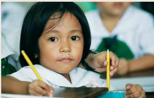
SOS Nursery School Cebu, Philippines