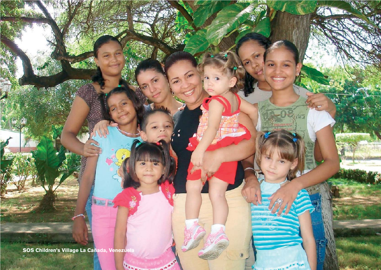
SOS Children's Village La Cañada, Venezuela