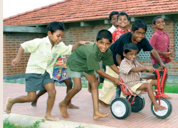
SOS Children's Village Hyderabad, India (Benno Neeleman)

Front cover: SOS Children's Village Meru, Kenya (Benno Neeleman)